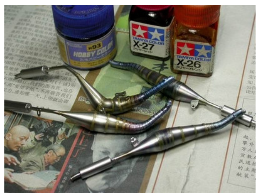
5. Tearing off the masking tape carefully.