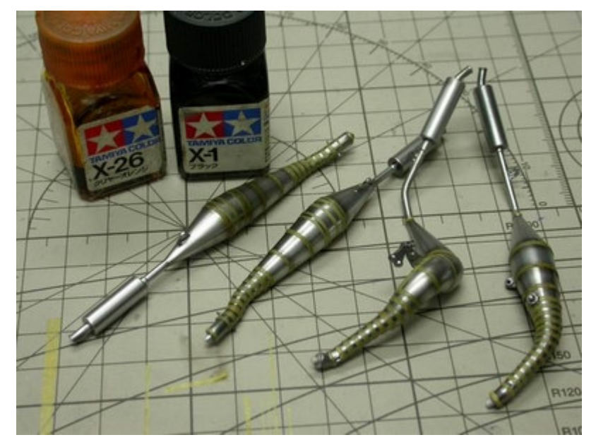
4. Airbrushing Tamiya's X-26(clear orange), X-27(clear red) and Hobby Color's H-93(clear blue) to different overheated areas.