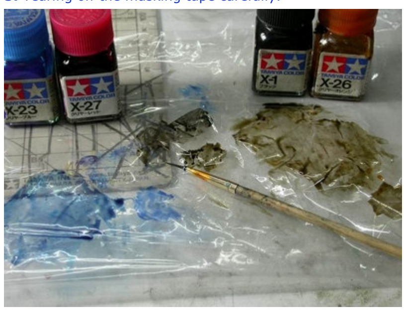
6. Brushing finely the weld seams with Tamiva's X-1(black)+X-26(clear orange) and X-23(clear